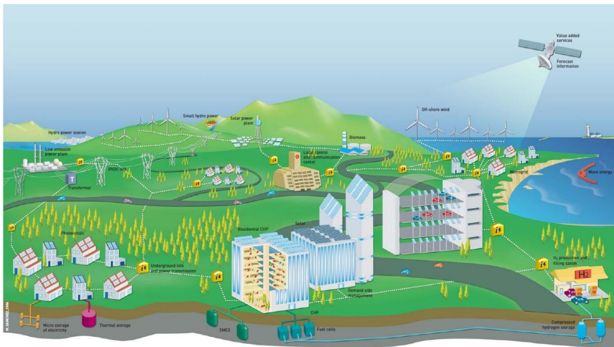
Figure: A vision of the new Smart Grid infrastructure with greater diversity and interconnectivity

UK Energy Networks are undertaking a transition from centralised energy generation to a model where energy generation is distributed via a larger and more diverse range of generation sources resulting in a shift from a passive to an active or “Smart Grid” where energy flows in two directions. This shift to an active and distributed grid demands a greater level of intelligence and interconnectivity (sensors, communications and control) and automation across the entire distribution network, to ensure co-ordination, efficiency, responsiveness, safety, security and resilience of supply.